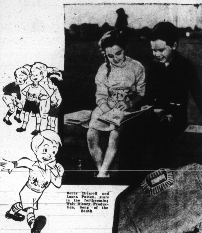
Bobby Driscoll and Luana Patten, stars in the forthcoming Walt Disney Production, "Song of the South"

STYLE A. Slip-on sweater with looped round neck—comes in Mickey Mouse, Donald Duck and Pluto designs. $3.00