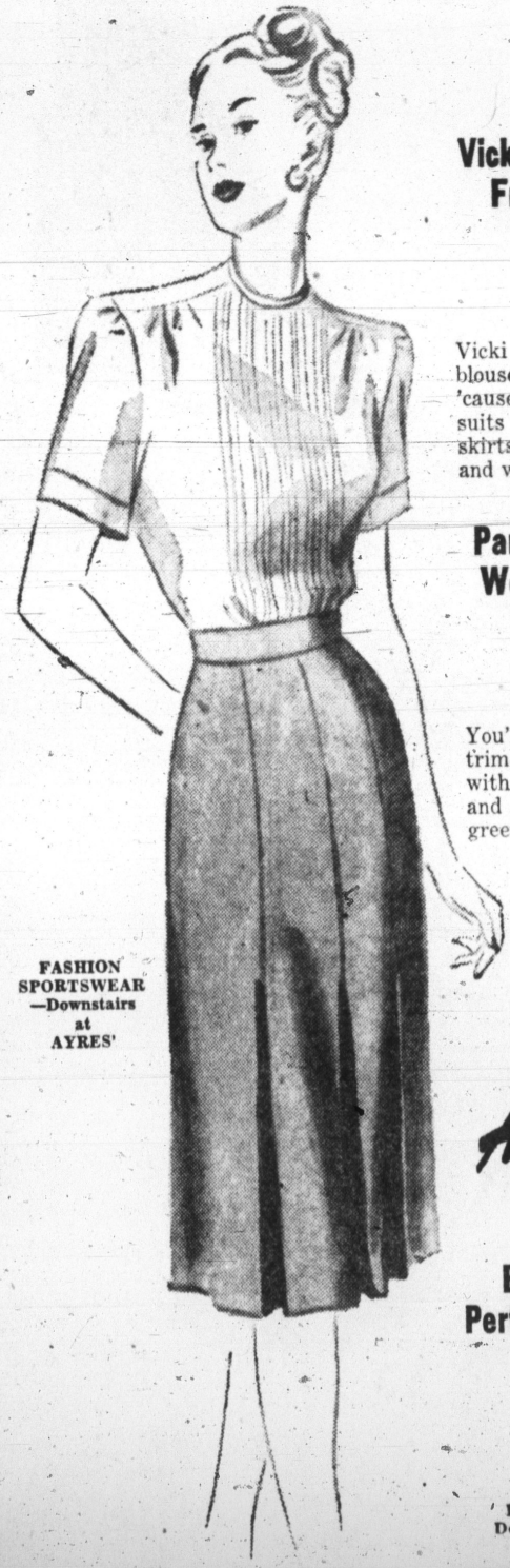
FASHION SPORTSWEAR—Downstairs at AYRES'

Vicki Lynn's Tucked Front Blouse In Extra Sizes