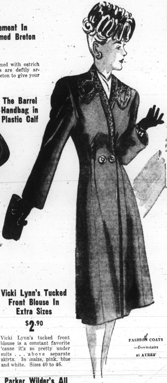
FASHION COATS—Downstairs at AYRES'

All-Wool Suede Woman's Coat Dressy With Soutache Braid