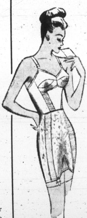
CORSETS—Downstairs at AYRES'