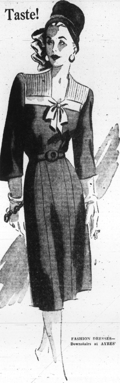
FASHION DRESSES—Downstairs at AYRES'

"American Girl" pumps set the pace for smart fall and winter shoes... these trim medium heeled pumps are but one style from a large assortment of new pumps.