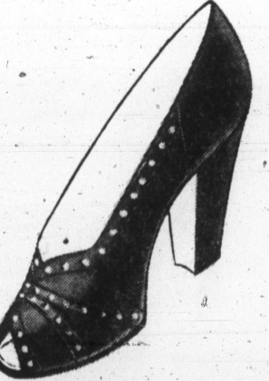
FASHION SHOES—Downstairs at AYRES'

"American Girl" pumps set the pace for smart fall and winter shoes... these trim medium heeled pumps are but one style from a large assortment of new pumps.