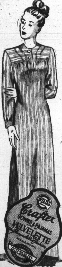
LINGERIE—Downstairs at AYRES'

Sorry! No Mail or Phone Orders Filled! Limit 2 to a Customer!