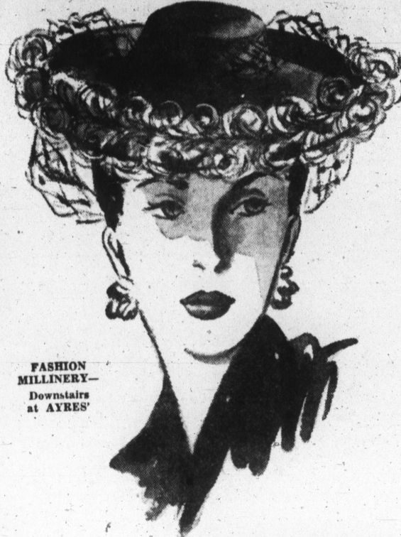
FASHION MILLINERY—Downstairs at AYRES'

Fall Hat Excitement In An Ostrich Trimmed Breton $3.98