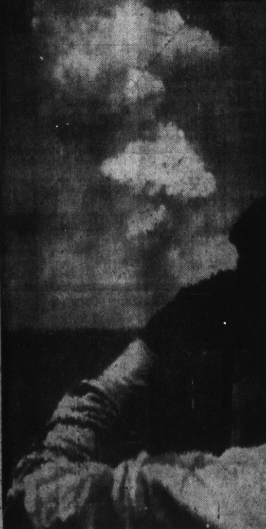
The giant atomic cloud created when the B-29 "Dave's Dream" tossed the A-bomb on the guinea pig fleet in Bikini lagoon is shown, above, as it spread skyward. Newspaper cameraman is in foreground, shooting from the bridge of Vice Adm. W. H. P. Blandy's flagship, the Mt. McKinley.