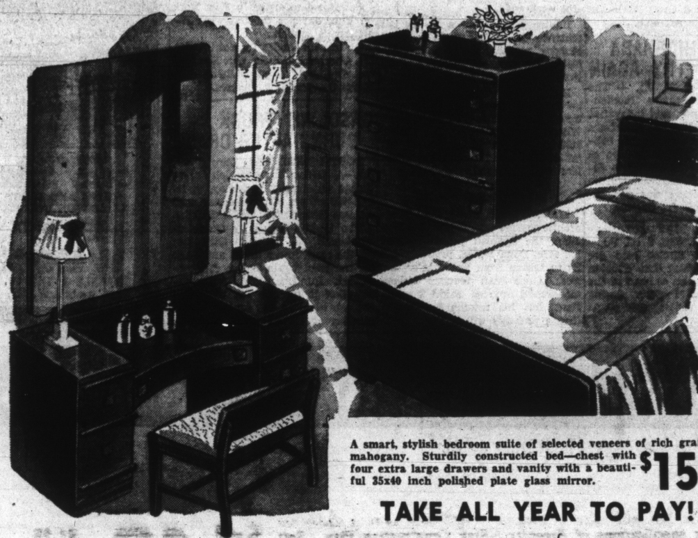
A smart, stylish bedroom suite of selected veneers of rich grained mahogany. Sturdily constructed bed-chest with four extra large drawers and vanity with a beautiful 35x40 inch polished plate glass mirror.

Every piece of furniture must go to make way for one of the largest, most beautiful and most exclusive music stores in the United States. Here's your opportunity to save substantially on countless items for the home. Prices smashed on everything. Bona-fide savings of 20%, 30%, 50% and more. Come early and browse around . . . there are many items available that we are not advertising because of limited quantities.