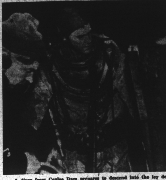
A diver from Coulee Dam prepares to descend into the icy deep waters of Lake Chelan in an effort to locate the bus and the bodies.