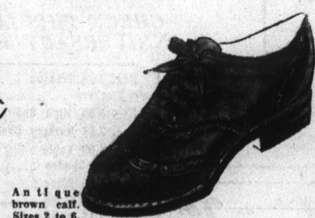
Antique brown calf. Sizes 2 to 6.