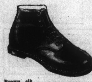
Brown elk Sizes 9 to 13