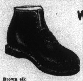
Brown elk Sizes 8 1/2 to 11 1/2