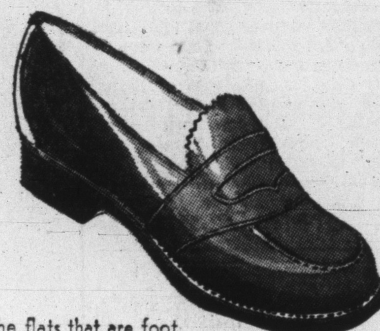
Strollers, the flats that are foot fashion for grade-schoolers and high-schoolers $5