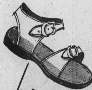
Non-Rationed: PLAY SHOES—White, brown and multi-color canvas sandal with plastic soles!