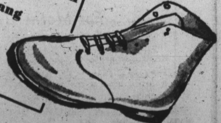
Buster Brown Toddler in white calf. Sizes 2 1/2 to 6.....3.50 Sizes 6 1/2 to 8.....4.00 Sizes 8 1/2 to 12.....4.50