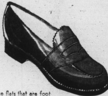
Strollers, the flats that are foot fashion for grade-schoolers and high-schoolers $5