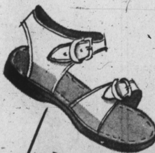
Non-Rationed! PLAY SHOES—White, brown and multi-color canvas sandal with plastic soles! Monument Store 1.69 to 2.99