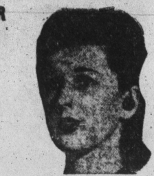
AUDIPHONE CO. OF IND. 108 N. PENN. ST. RM. 1116 LI. 5098 (T. TH.)

PHONE OR MAIL THIS COUPON FOR INFORMATION NAME _____ ADDRESS _____ CITY _____ STATE _____