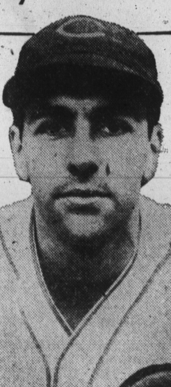
Lou Boudreau, Cleveland Pilot