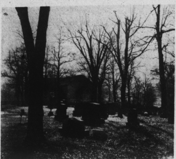
Church of the Wildwood

visions a new community hall or an addition to the present church.