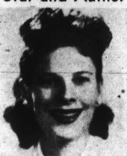
Ruth Gordon is star and author of the comedy, "Over Twenty-One," opening tonight at English.