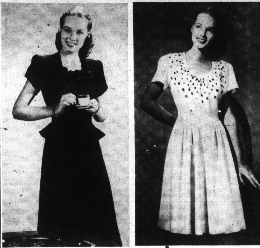
Two pert "date bait" fashions for junior girls are shown here. At the left is one suitable for a dean's tea, for dates and dinners. It's a waist-whittling peplum frock in black or fuchsia keds crepe. Sequined flowers catch the light and call attention to a softly draped neckline. The diminutive peplum juts out perkily, adds the ends in back. The sleeves are the right length for the new longer gloves. Creamy white teca blend flannel makes the dress-up dirndl at right, blossoming with head-centered flowers of bright-colored felt. Prized by juniors are the scooped-out neckline, the brief, wide sleeves and the skirt's fullness in front contrasting with a smooth, slim back. (Both frocks at Ayres')