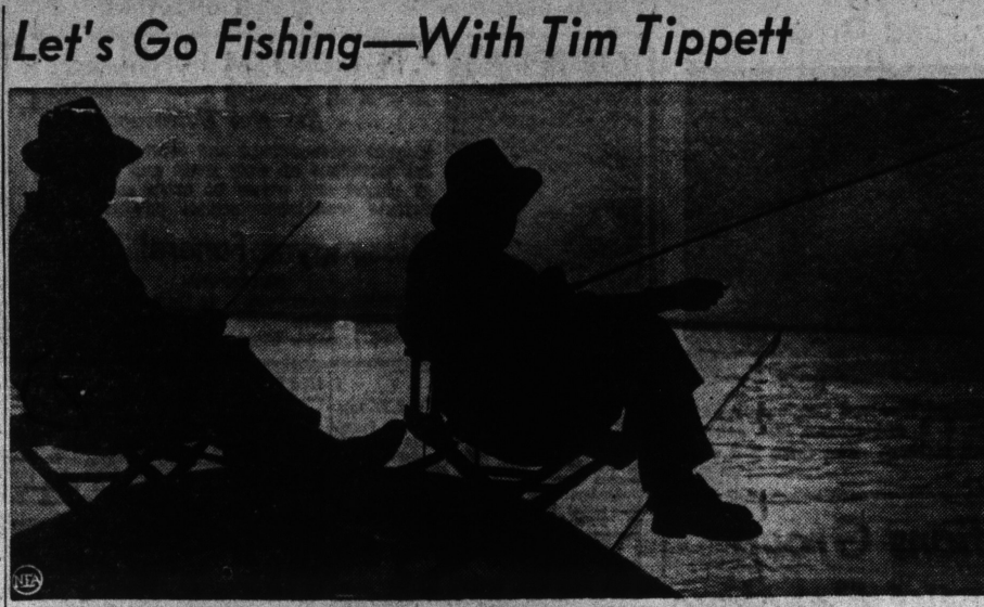
Fishermen idle back in chairs on the deck of a boat and troll for striped bass as the setting sun weaves a golden path across Scuppernon River in eastern North Carolina.