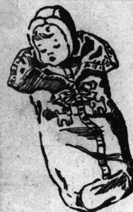
The Bunting with hood pictured, 2.50 — Others up to 5.98.

Dresses embroidered white and pink and blue, 1.98 Hospital Coat, 100% wool, 2.49 Bootees, Pink and blue, .89 Sweaters, 100% wool, Pastel colors, 2.98 All-wool Hoods or Helmets, 1.98 Buntings with Hood, Pink and blue, 2.50 Creepers, hand made and embroidered, 2.98 Nodkins, A three-in-one garment, 2.59 Receiving Blankets, 28x38, .39 Sacques, All-wool, Pastel colors, 1.98 Shawls, Fringed, Pink and blue, 2.98 Rubber Pants, .50 Terry Cloth Bib, .29 Knit cotton shirts, 2 to 6, .39 Crib Quilts, Pink and blue, 2.98 Mittens, Pink and blue and white, .59 Star and Cross Diapers, 20x40, Doz., 1.59 Infants' Knit Creepers, Pink, blue, white, 1.00 Percale Crib Sheets, 42x72, 1.49