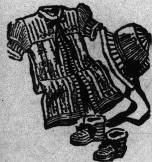
The Hospital Coat 2.49 The Booties .89c The Hood 1.00 to 1.98