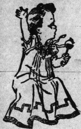
The dress pictured is typical of a variety that is priced from 1.98 to 4.98.

Have you visited Wasson's Baby Shop lately? You'll be surprised at the splendid selection of Infants' and Children's needs so attractively priced. Shop Wasson's Downstairs Store Baby Shop Tomorrow.