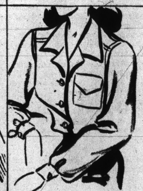
Convertible neckline shirt in white slub broadcloth; long sleeve. Action back. Sizes 7 to 14, $2.00.