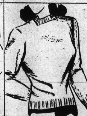
All-wool slipovers with long sleeves. Attractive pastels in sizes 7 to 14, $3.00.