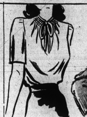
Rayon jersey blouse for high school. Bow tie or cowl neckline. White, pastels or deep tones. Sizes 10 to 18, $2.25.