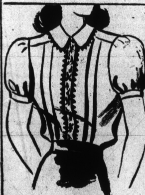
White rayon crepe blouse. Peter Pan collar. Colored embroidery trim. Sizes 7 to 14, $2.00.

Choose From HUGE Assortment In Our YOUTH CENTER!