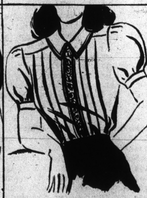
White slub broadcloth blouse. Peter Pan collar. Colored trim. Sizes 7 to 14, $1.29.