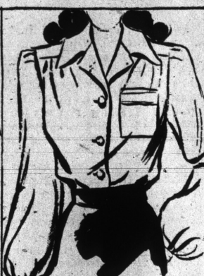
"Bermuda" long-sleeve shirt; rayon crepe; action back; open or closed neckline. White and pastels. Hi-school sizes 32, 34, 36, $2.35.