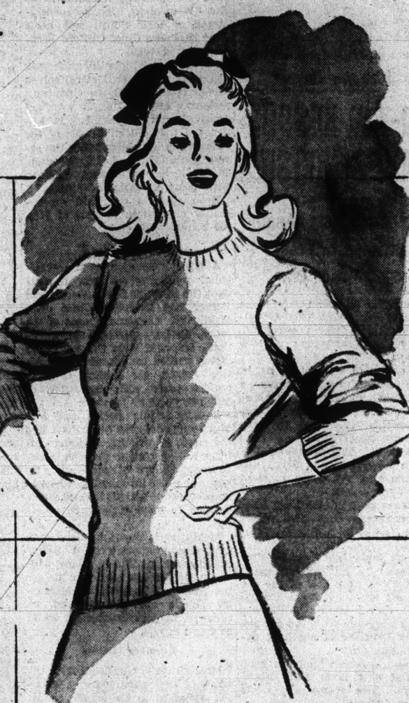
"Kingston" heavy shaker knit slipover sweater in luscious shades of melon, lime, maize, lilac and white. Hi-school sizes 34 to 40, $3.98.

Choose From HUGE Assortment In Our YOUTH CENTER!