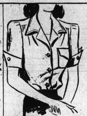
"Fruit of the Loom" white broadcloth shirt; action back; French cuffs. Sizes 10 to 16 for hi-school, $1.69.