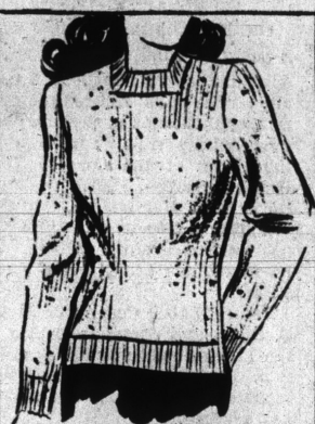
High school Penrose sloppy slipover. Nubby zephyr-knit wool. Powder, cherry, violet. Sizes 34 to 38, $5.98.