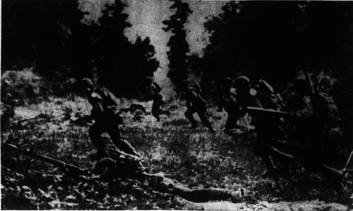
Yank infantrymen dash across an open field in the face of heavy machine gun fire to engage S. S. troopers in close battle. The soldier in foreground lies prone to fire a rifle grenade. At the right a bazooka gunner races along with his comrades to join the attack.