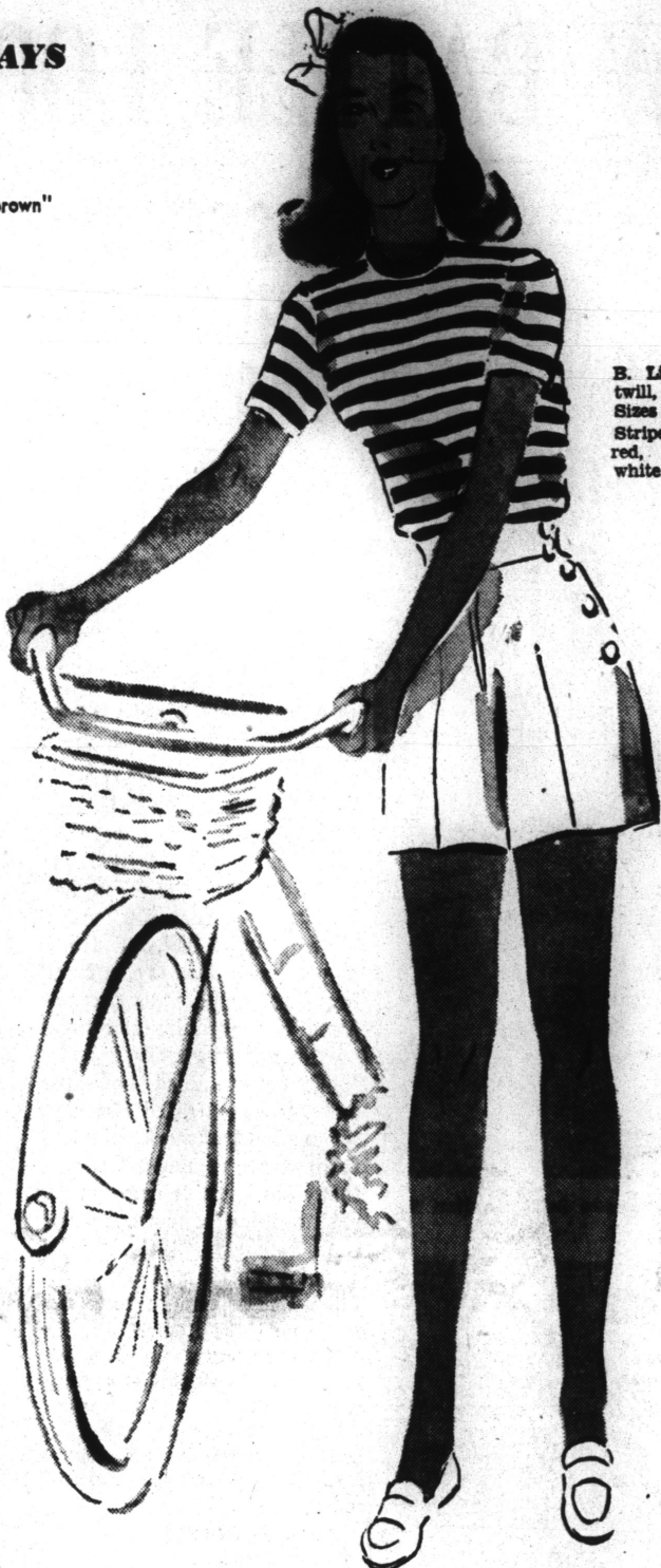
B. Little Boy short in twill, white or navy. Sizes 10 to 20. 3.00 Striped T shirt in blue, red, green, navy or white. 2.00