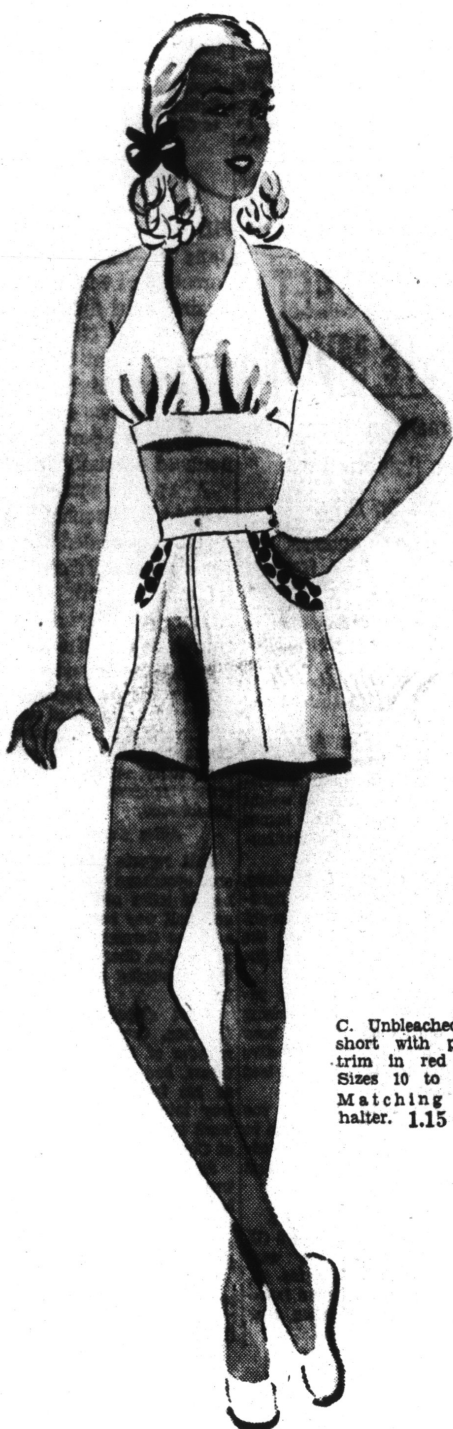
C. Unbleached muslin short with polka dot trim in red or blue. Sizes 10 to 20. 2.00 Matching reversible halter. 1.15