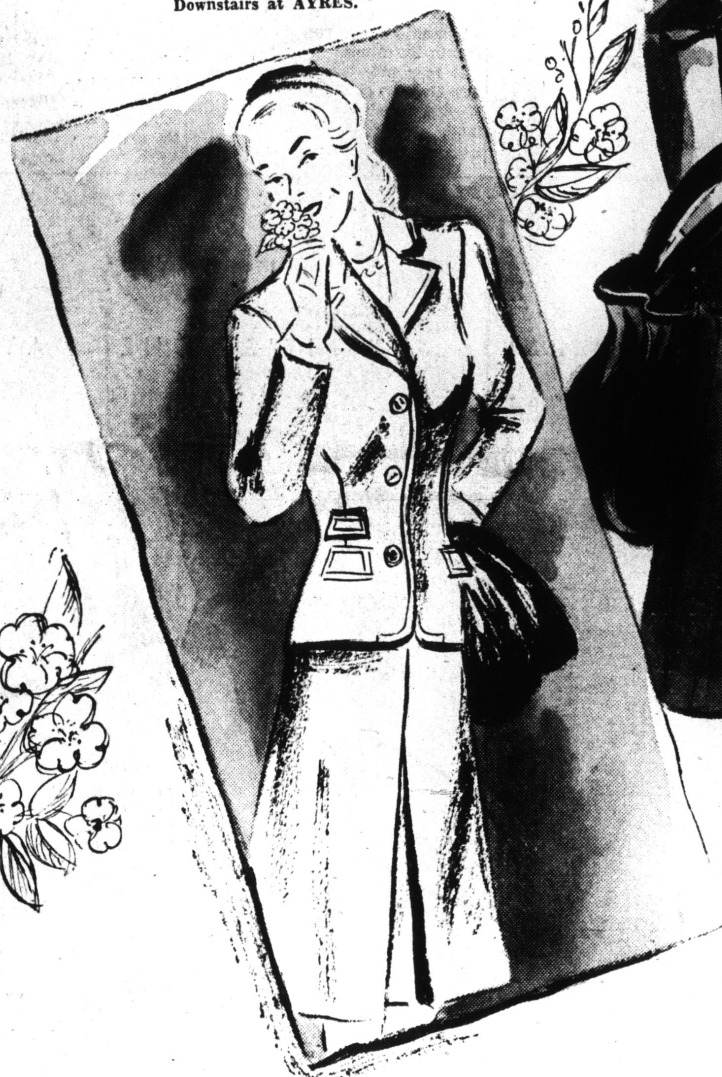
Reefer coat in all-wool shetland. New, soft waistline, gored back. Pastels.