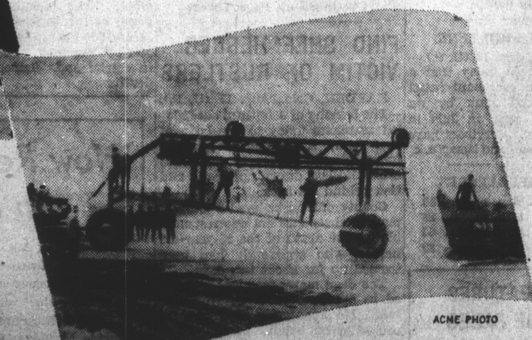
Boat carrier, designed by Adams, used by Navy in landing operations. This photo from Attu Island.

ADAMS Road-Building and Earth-Moving Equipment