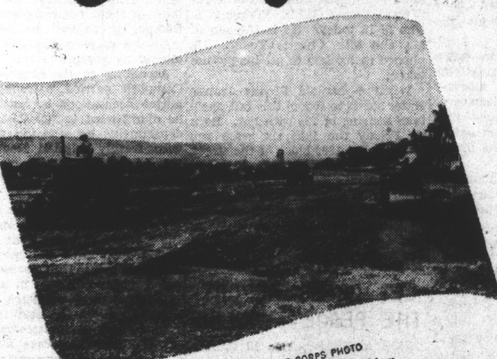
Adams Motor Grader working on Henderson Field, Guadalcanal.

J. D. ADAMS MANUFACTURING COMPANY 217 S. Belmont Avenue • Indianapolis, Indiana