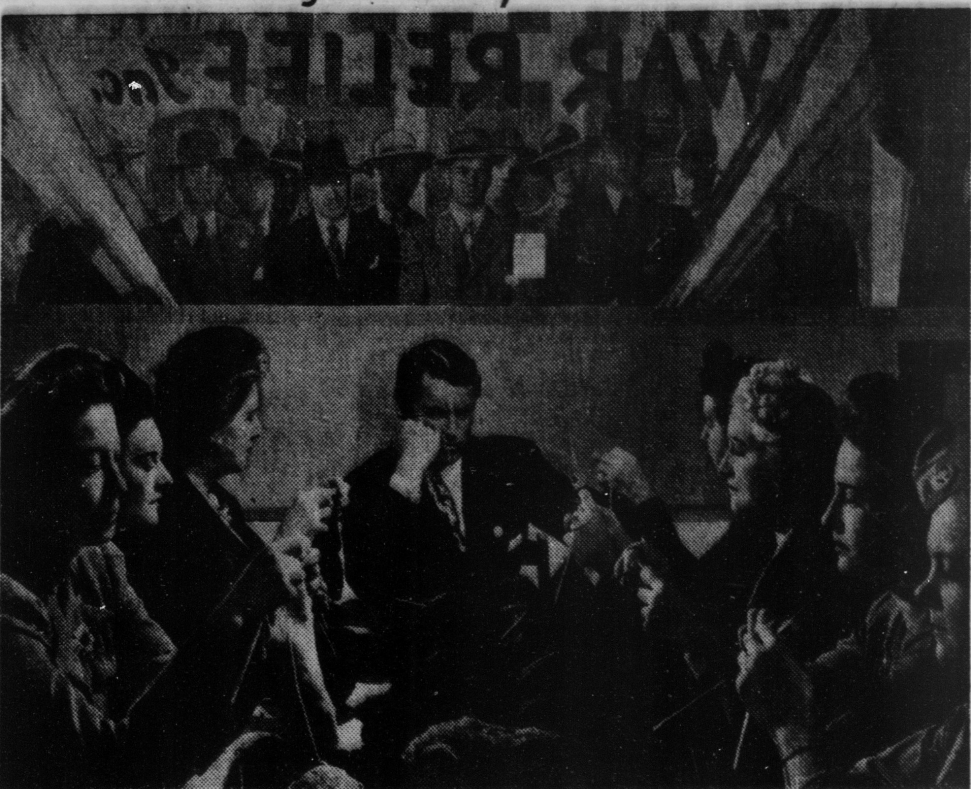
Cary Grant not only attends a knitting bee, but learns how to knit in "Mr. Lucky," now playing at the Indiana. That film had its New York premiere last Thursday.