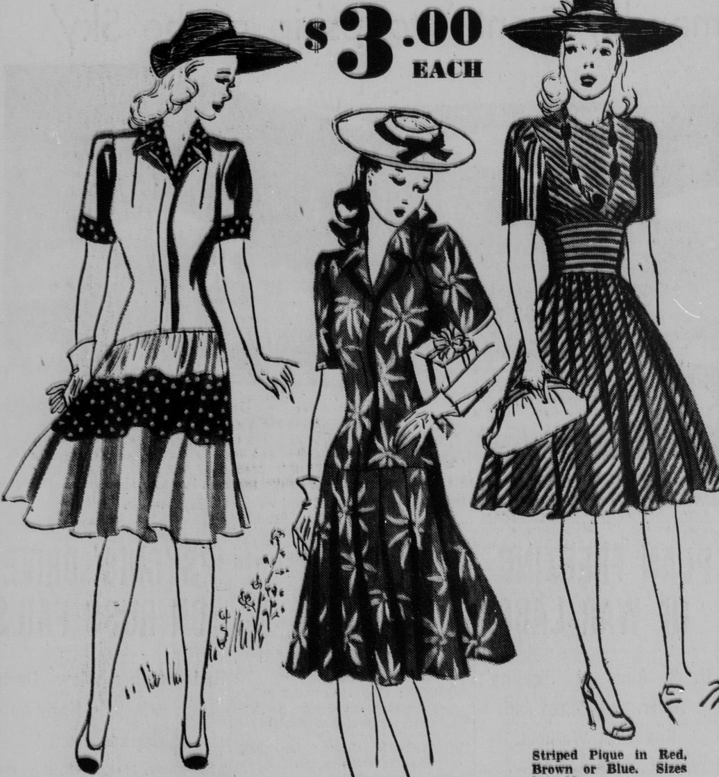
Rayon Luana in Beige with Green, Beige with Luggage. Sizes 9 to 15.