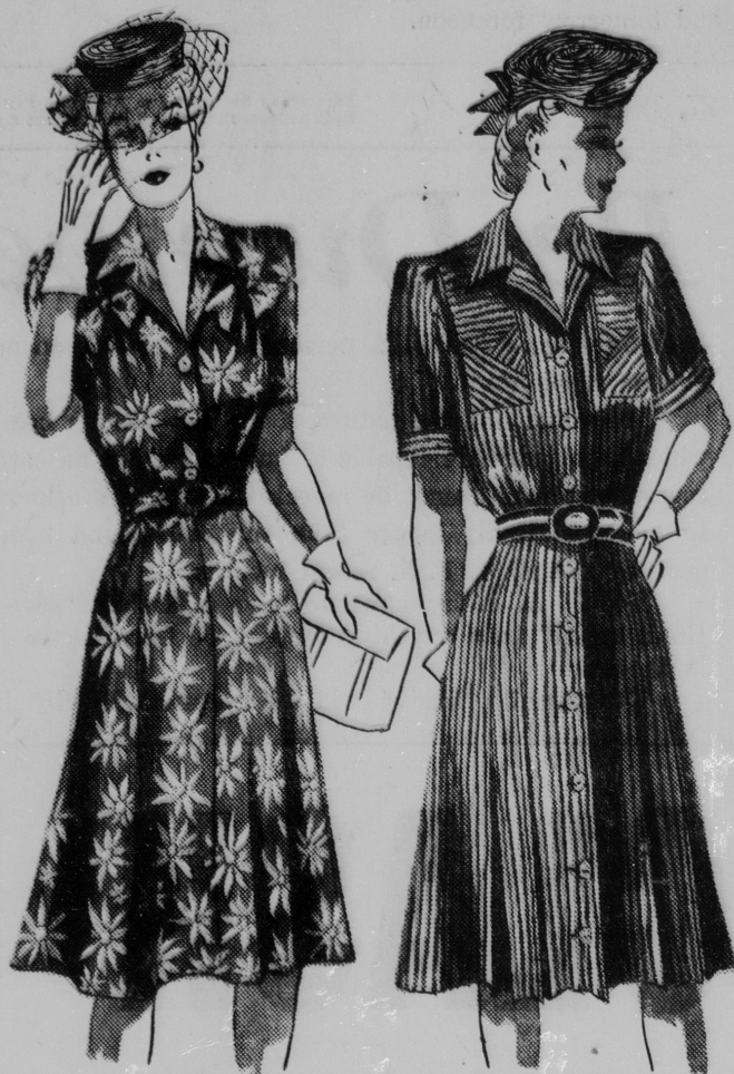
Luggage, Green, Navy and Powder Blue, Sizes 38 to 44.