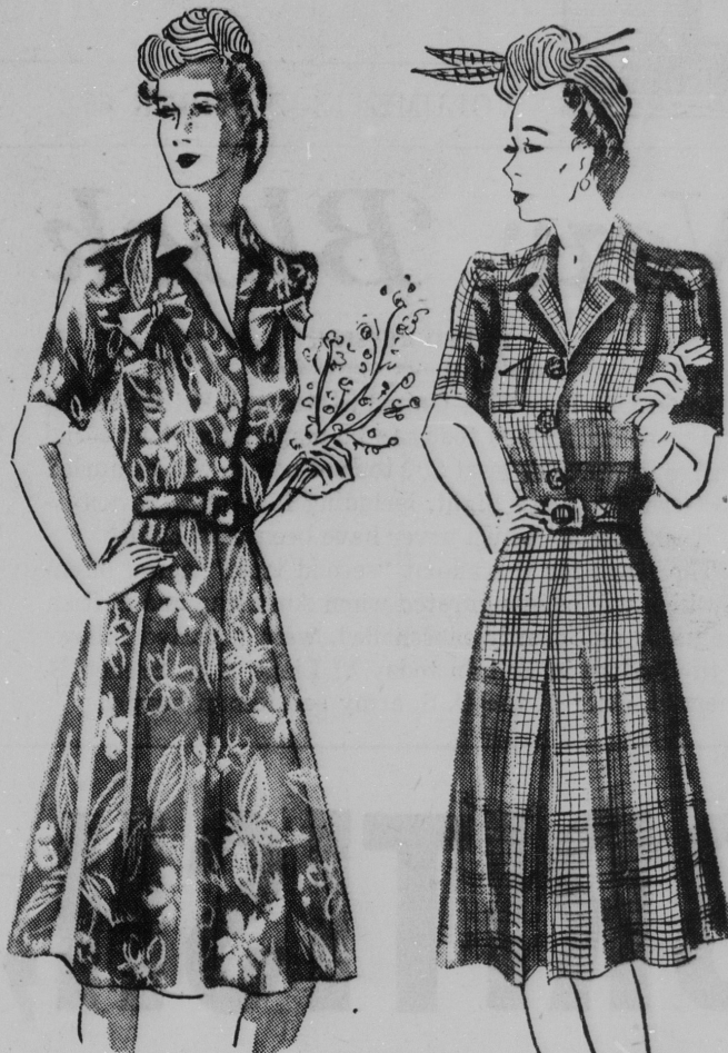
Green, Navy, Luggage, Powder Blue and Black, Sizes 16½ to 24½.