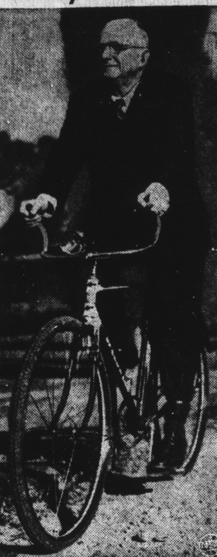
Nelson T. Johnson, United States minister to Australia, rides his bicycle to the American legation at Canberra to help Australians save gasoline.