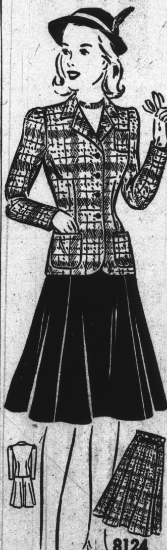
Pattern No. 8124 is designed for sizes 11 to 19. Size 13 jacket requires 2 1/2 yards 35-inch material; 1 1/2 yards 54-inch and 2 1/2 yards 35 or 39-inch lining. Skirt, 2 1/2 yards 35-inch material; 1 1/2 yards 54-inch.

For this attractive pattern, send 15c in coin, your name, address, pattern number and size to The Indianapolis Times, 214 W. Maryland St.