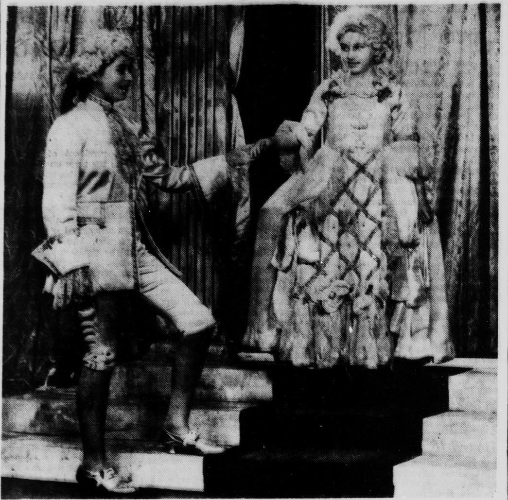
Princess Elizabeth of Britain (left) as Prince Florizel greets Cinderella, played by her sister, Margaret, in a village pantomime produced recently to aid the Royal Household Comforts Wool Fund. Other members of the cast included London evacuees, children and officers' daughters.