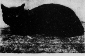
Do you want to meet Penny Penguin today? Penny Penguin is a black cat and today is Friday the 13th!