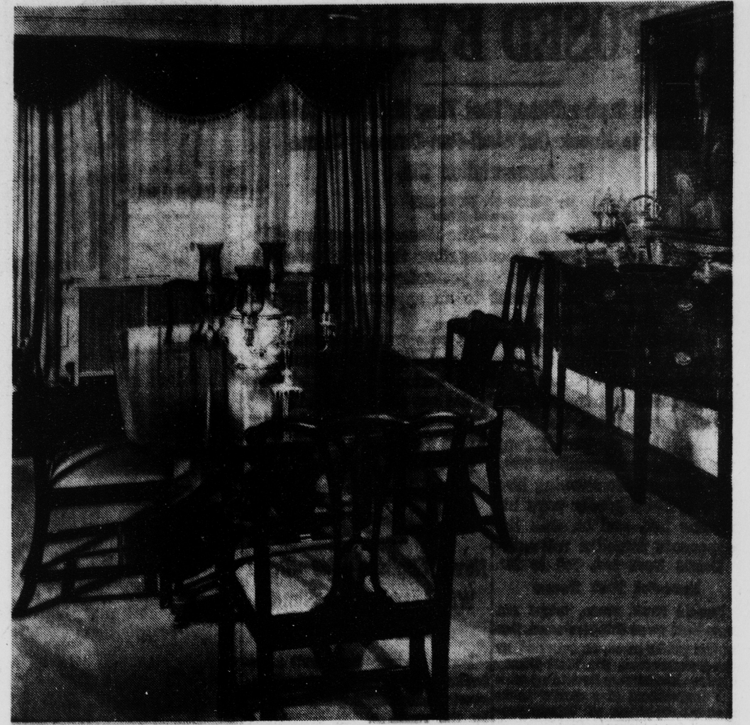
Against the rich coloring of the crimson and beige draperies and the cream-painted walls of the Hulls' dining room, the 18th Century mahogany pieces show to excellent advantage. Simplicity is the keynote of the furnishings throughout the apartment.