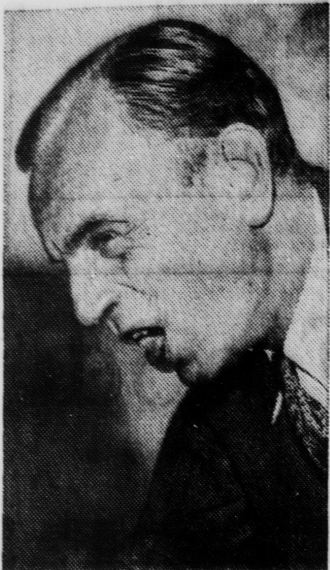
James M. Landis