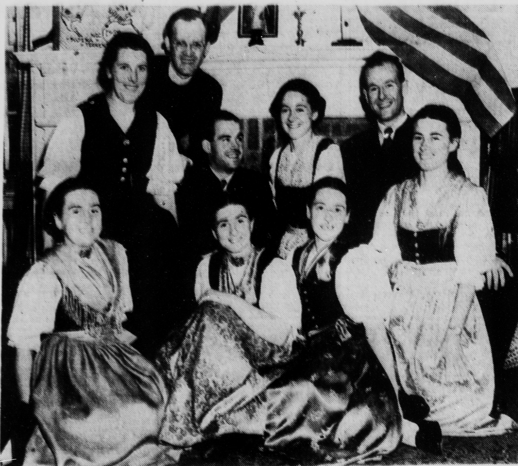
Baron von Trapp and his family of singers.

FAIRBANKS LOAN COMPANY 203 EAST WASHINGTON We Buy or Loan on Your Coat