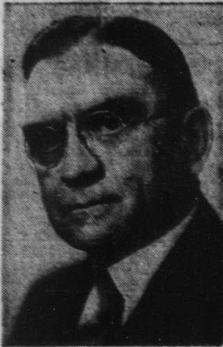
Senator Van Nuy

Strike out $5 auto use tax, VanNuy nay, and Willis not recorded; $5,985,000,000 lend-lease appropriation, VanNuy yea, and Willis not recorded; keep belligerent port and combat zone bans both yea; repeal