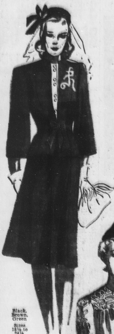
Black, Green, Brown Sizes 14 to 24