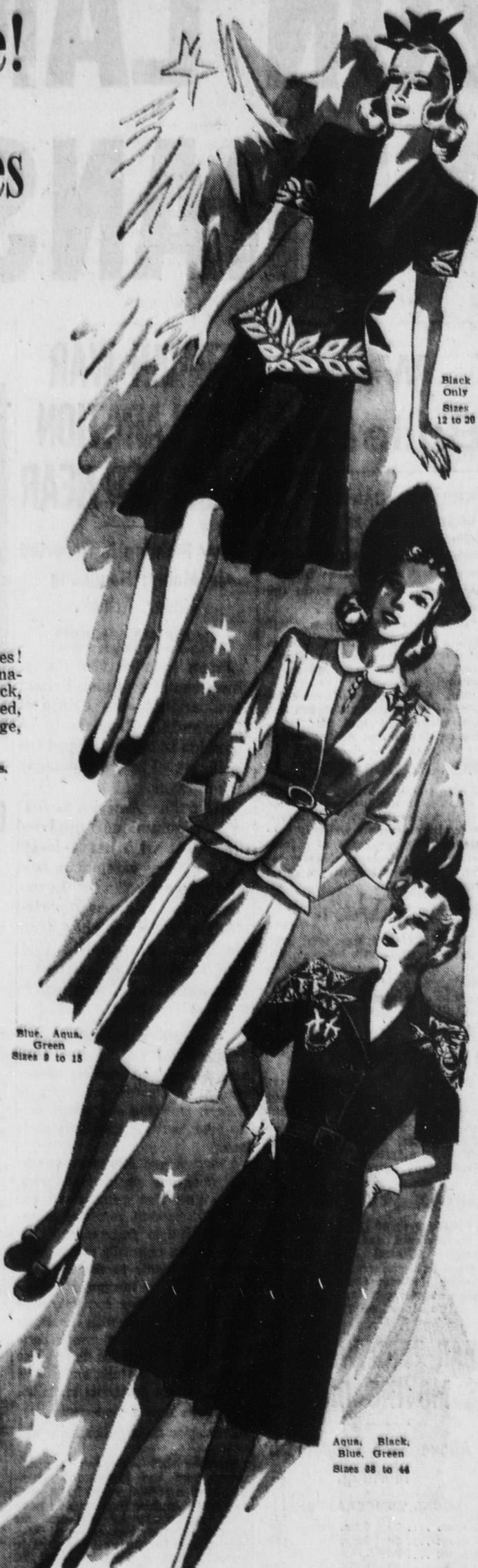
Black Only Sizes 12 to 20