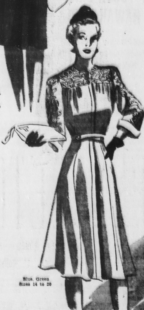
Blue, Green Sizes 14 to 20