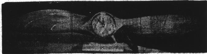
For air-minded people, to whom time is all, the gift of a clock embedded in a miniature mahogany propeller will tick away many happy hours, especially when it's electrically accurate.