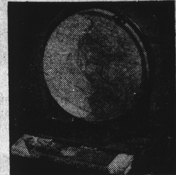
Globe and Atlas are choice selections this season as gifts for the man who is following international events. They will keep him wise, make him an authority.