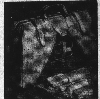
Well fitted—a man's bag suede lined, with military pockets and straps. The drop compartment slide fastens to become one with the bag.