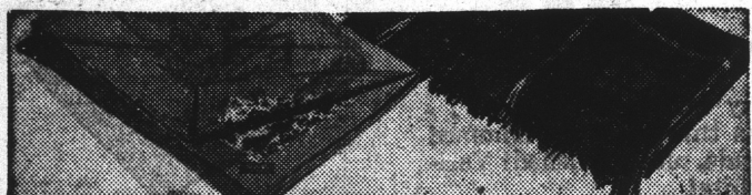
A gift of warmth for winter autists is the motor robe—either in fur fabric lined wool or fringed blanket cloth. Both types also come in sizes for baby's carriage.