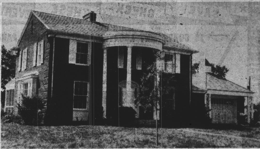
The Mt. Vernon-Electro home... Colonial style with ultramodern conveniences.

Lawn Seed, Fertilizers, Pruning Shears & Saws, Garden Tools, Fencing Lawn Rollers, Trellis VONNEGUT'S • 120 E. Washington, MA-2321. • 38th and Illinois Sts., TA-3351. • 42nd and College, HU-1367. • Broad Ripple, 808 E. 64th, BR-5164. • Irvington, 5609 E. Wash., IR-2323. • East 10th at LaSalle, CH-2321. • Ftn. Sq., 1116 Prospect, MA-3976. • 2125 W. Wash. St., MA-2221.