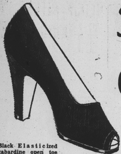
Black Elasticized gabardine open toe pump. High heel, Patent trim.