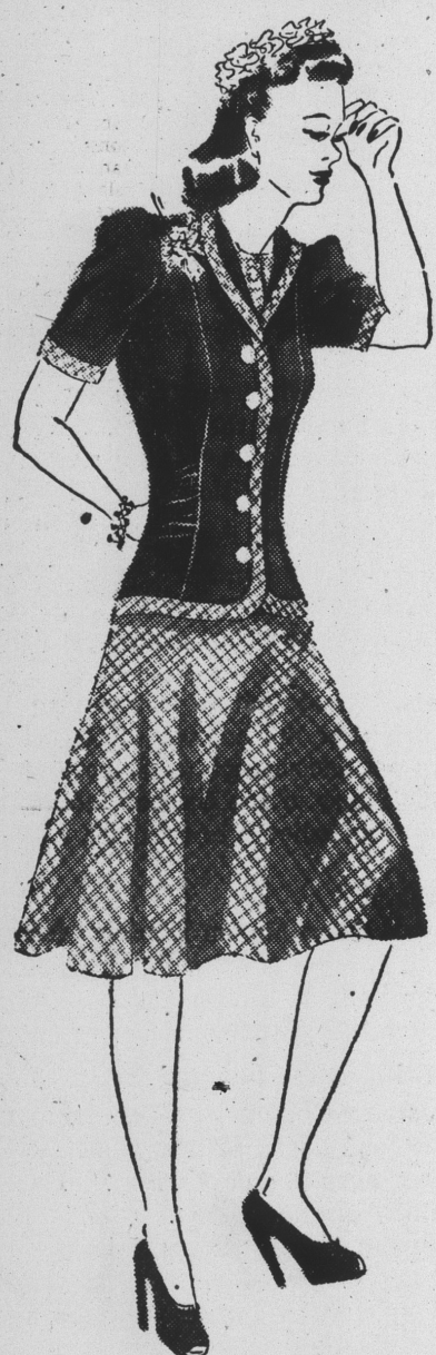
Check and Double Check