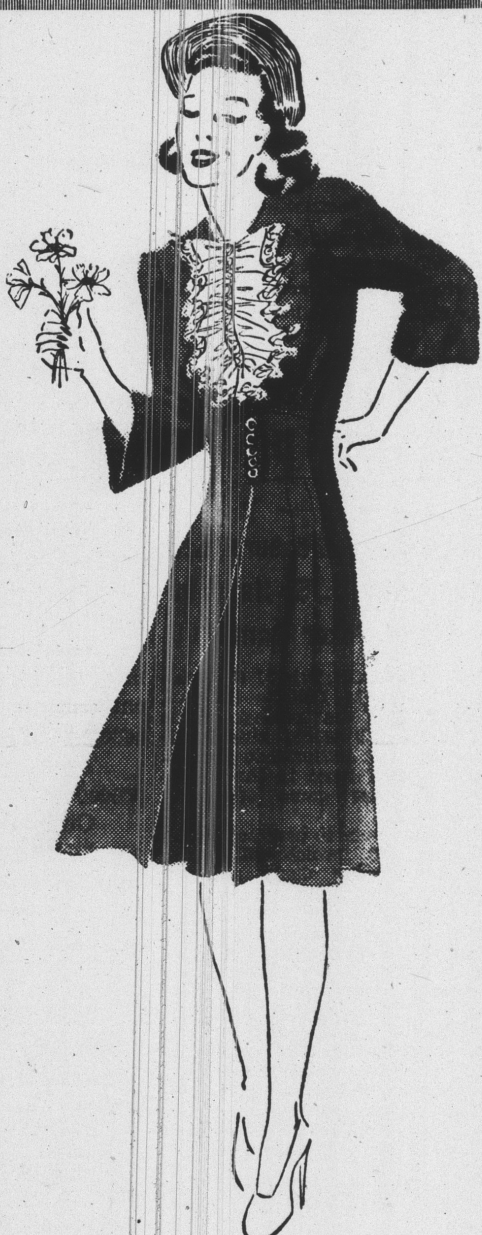
Get a New Accent on Charm!

We call it check and double check because of its charming versatility. A check dress with solid color jacket trimmed in the same check fabric. Colors in Black or Navy. Jacket is fitted with pearl buttons to waist. Dress also has pearl buttons to waist. —Downstairs at Ayres.