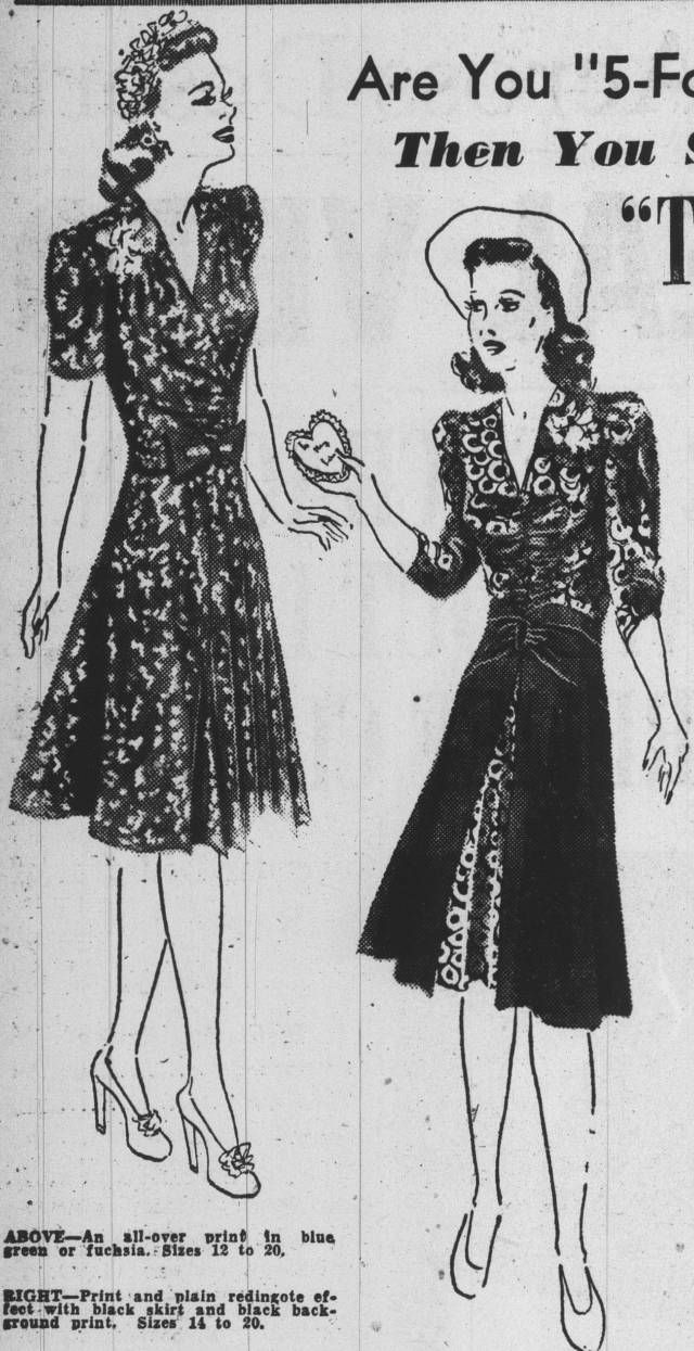
ABOVE—An all-over print in blue green or fuchsia. Sizes 12 to 20.