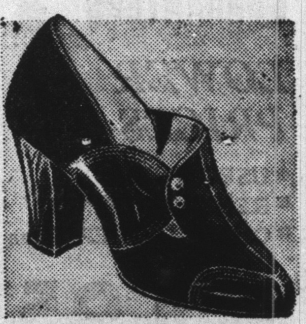
Sale Price ....$1.00 Pr.

PURCHASES OF $10 OR MORE SOLD ON SEARS EASY PAYMENT PLAN