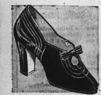
Sale Price ....$1.00 Pr.