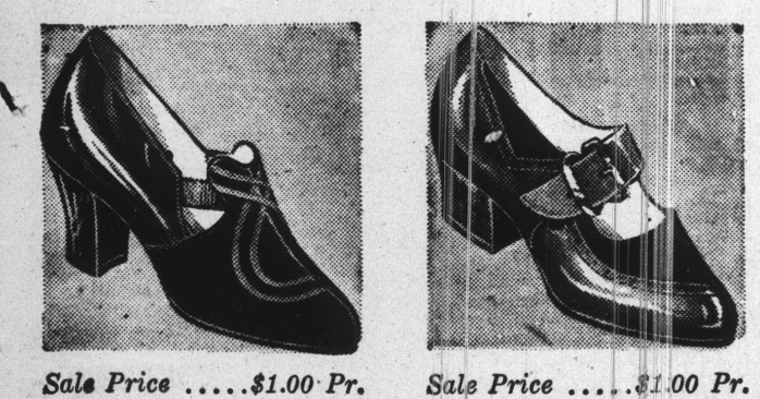
Sale Price ....$1.00 Pr.