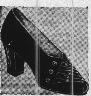
Sale Price ....$1.00 Pr.

Sizes 4 to 9. Widths AAA to E All sizes and widths in the group but not all sizes and widths in every style.