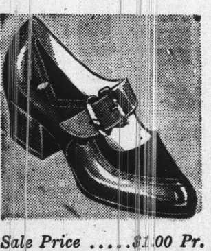
Sale Price ....$1.00 Pr.