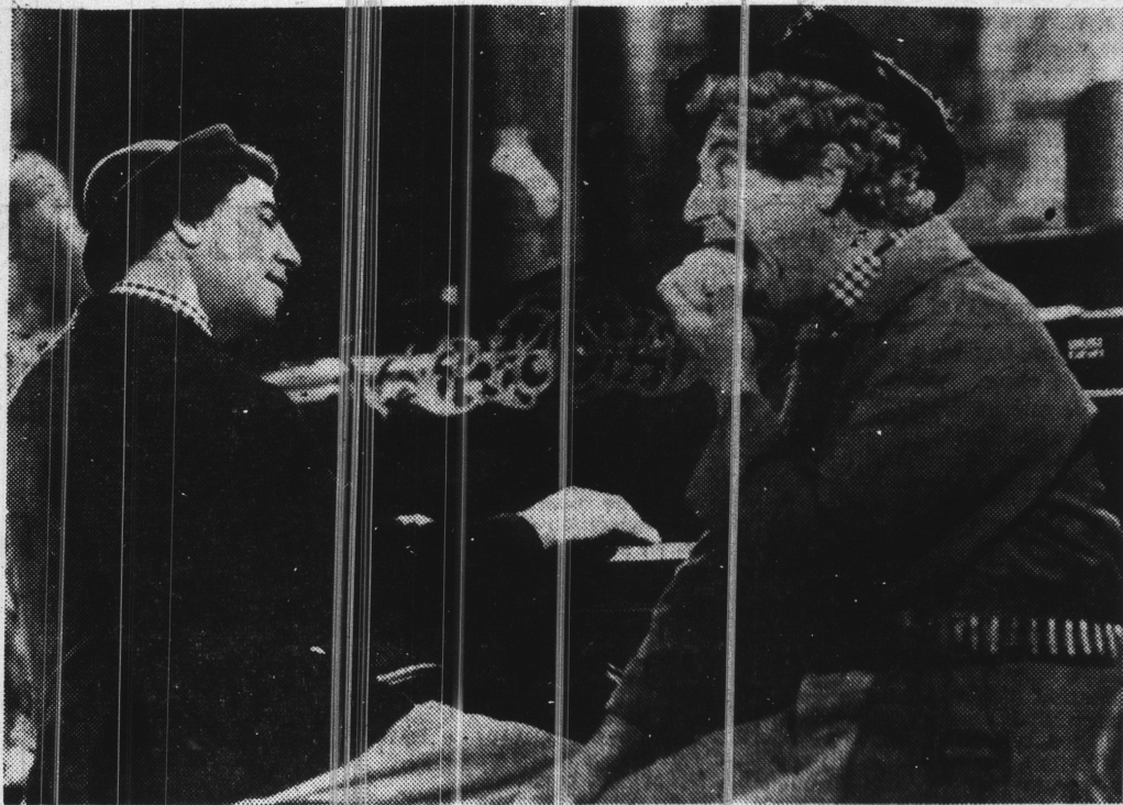
Life with the Marx Brothers, usually a pretty hectic and amusing experience, will begin at Loew's tomorrow when the brothers' latest comedy with music, "Go West," opens a week's showing. By way of samples, here are the boys at their familiar pastimes.

Groucho leaves off his courtship of the blue-eyed Indian maid long enough for some fancy gun play. Harpo also does a little harp-playing in addition to apple-eating, and Groucho leaves off his courtship of the blue-eyed Indian maid long enough for some fancy gun play.