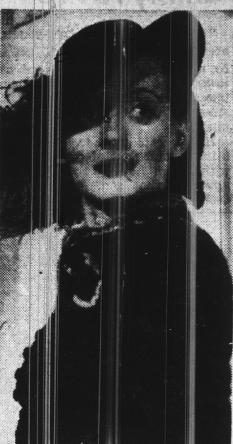
Bette Davis... gives Hollywood its first surprise of year.