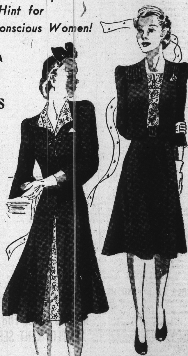
Black and Navy Sizes 18 1/2 to 24 1/2