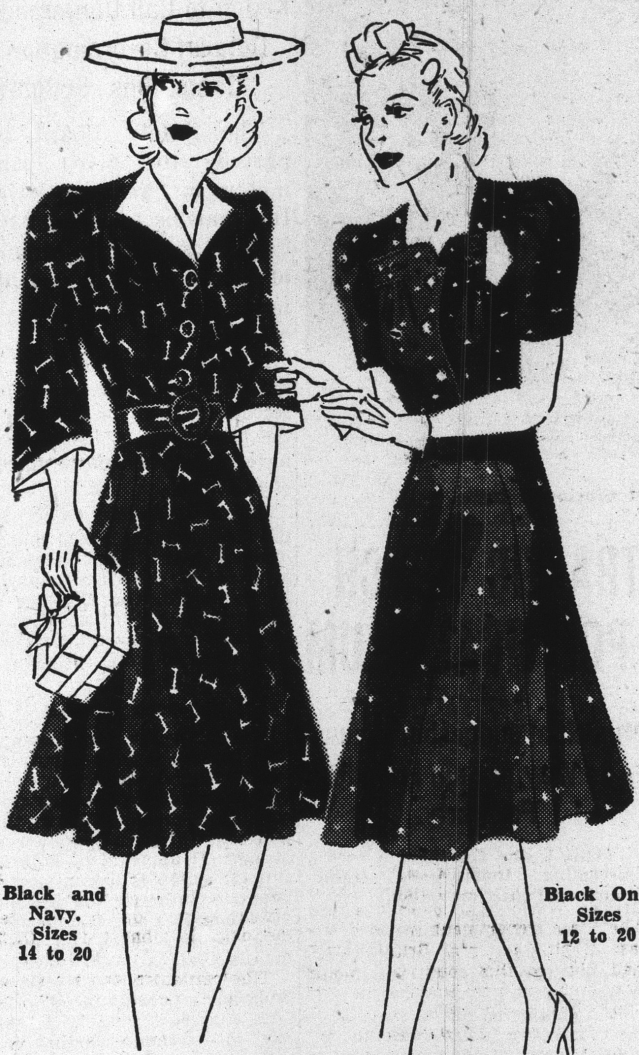
Black and Navy. Sizes 14 to 20

Store Hours: 9:30 A. M. to 6 P. M. Every Day Till Christmas