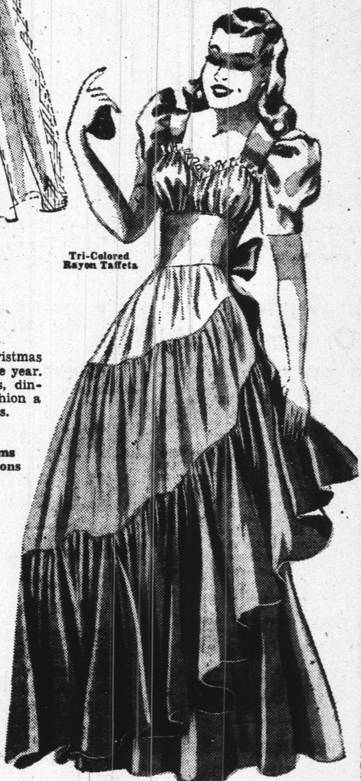
Tri-Colored Rayon Taffeta