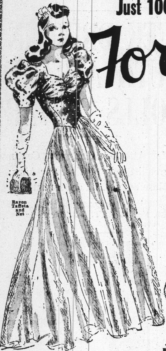
Rayon Taffeta and Net