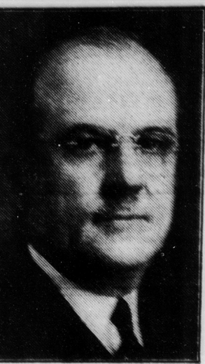
Francis P. Matthews, President of the K. of C. Parley, opens at home.