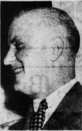
Edward J. Flynn... one of Mr. Roosevelt's closest friends.