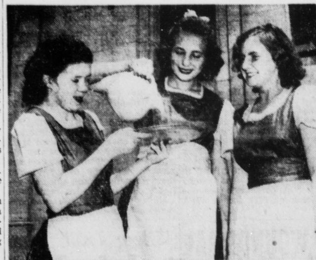
There'll be a sidewalk cafe at the St. Joan of Arc Harvest Festival and there'll be these attractive girls to wait on you. The festival will be held July 26 and 27. It will include a dance, dramatics and demonstrations by the young people of the church.