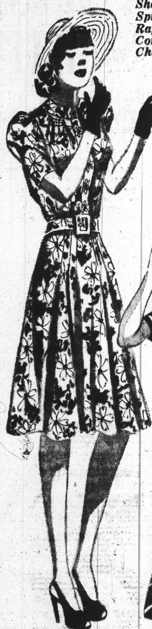
Sizes 12 to 20

Sizes 9 to 17, 12 to 20, 38 to 52 in the group.