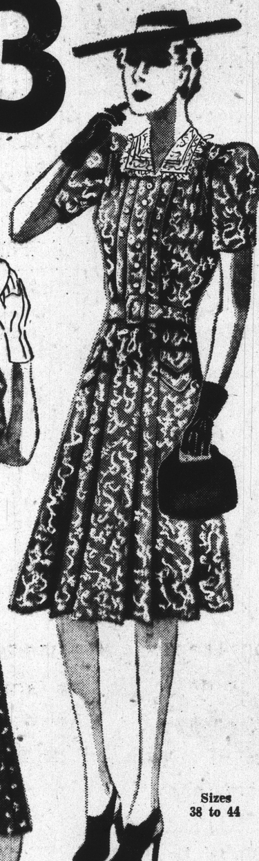
Sizes 38 to 44