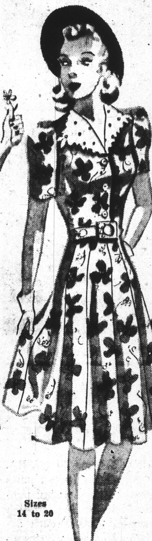
Sizes 14 to 20