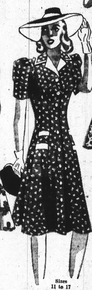
Sizes 11 to 17