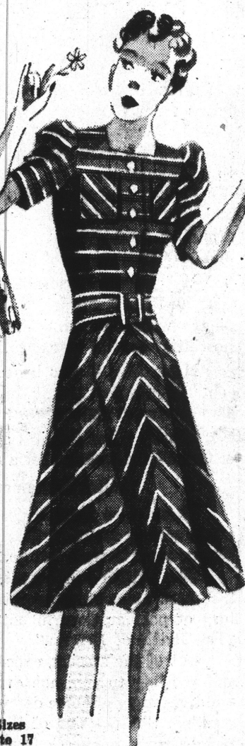
Sizes 9 to 17