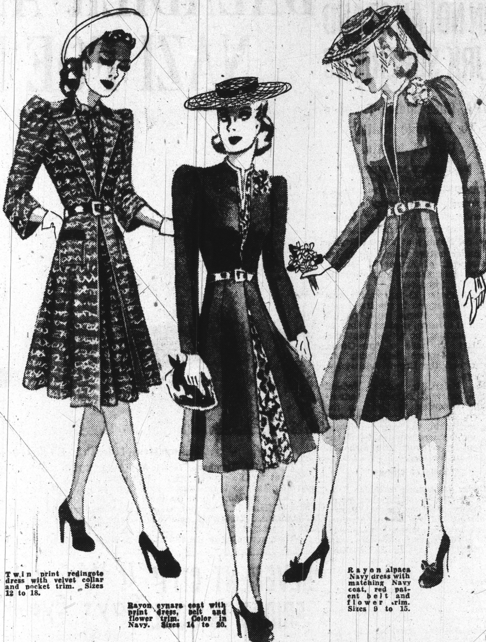
Twin print redingote dress with velvet collar and pocket trim. Sizes 12 to 18.