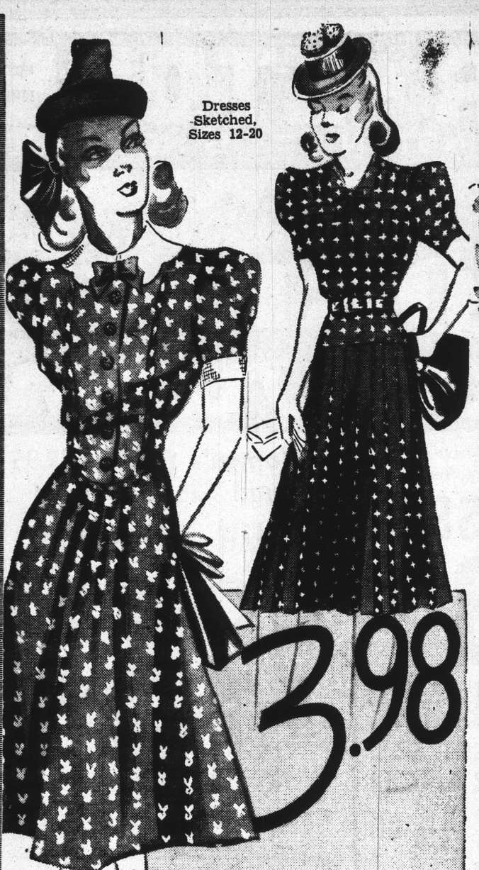
Dresses Sketched, Sizes 12-20

MARION POULTRY CO. FREE DRESSING WHILE YOU WAIT 1022 S. Meridian Open Sunday Till Noon