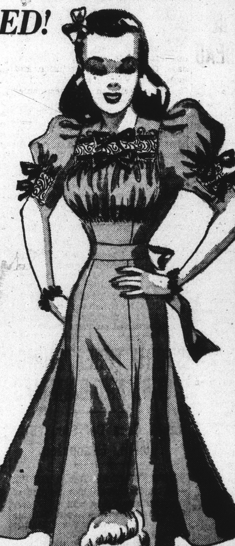
Rayon alpaca dress, lace and velvet trim. Color: Green. Size 11 to 17.