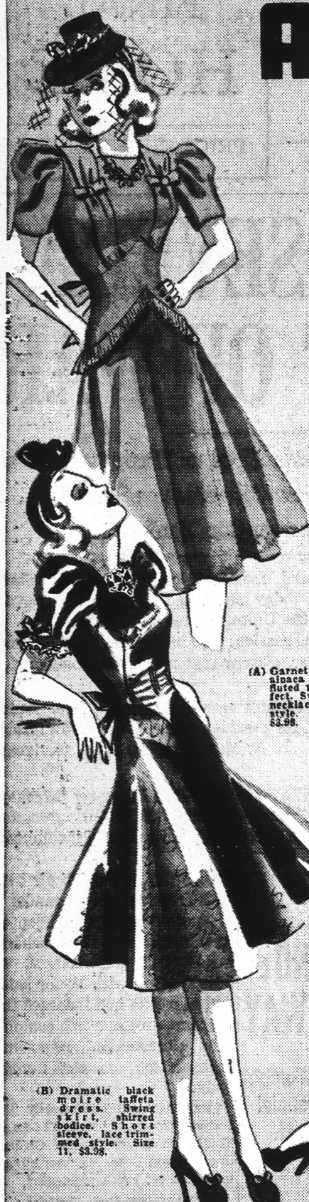
(A) Garnet red rayon alpaca dress with fitted bodice and full skirt. Neckline 1 1/2 in. Size 11. $3.98.