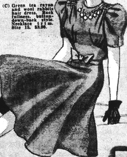
(C) Green tea rayon and wool rabbits hair dress. Back fullness, button-down-back style. Neckline 1 1/2 in. Size 11. $3.98.